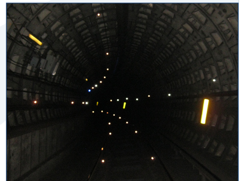
Monitoring Tracks and Tunnel