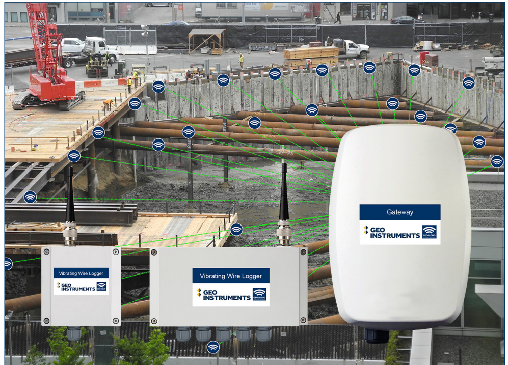
Single-sensor and multi-sensor nodes with internet gateway. Self-powered and wireless, nodes can be placed anywhere on site, including locations that would be impractical with traditional data acquisition systems.

Interface Nodes: Interface nodes are similar to logger nodes, but are designed for read-and-send operations and store only a few readings temporarily. Interface nodes use 2.4 Ghz radio bands, which tend to provide shorter range. However, battery life is very good for most interface nodes and some tiltmeter nodes are extremely compact.