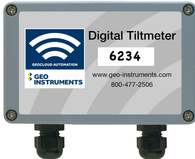
The Electrolevel Tiltmeter is available with a standard or digital interface

Beams: Tiltmeters can also be mounted on low-profile beams to monitor relative movement between anchor points at either end of the beam. An array of beams, each sharing an anchor point with the next, can be used to monitor differential settlements, deformations, and convergence.