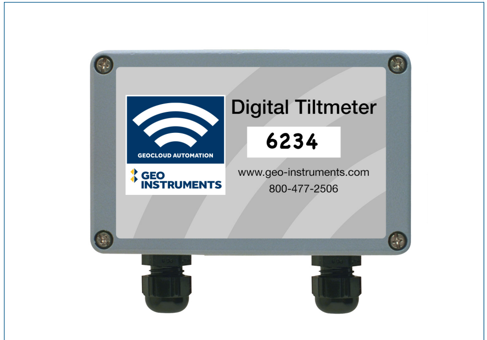
The Electrolevel Tiltmeter is available with a standard or digital interface

Beams: Tiltmeters can also be mounted on low-profile beams to monitor relative movement between anchor points at either end of the beam. An array of beams, each sharing an anchor point with the next, can be used to monitor differential settlements, deformations, and convergence.