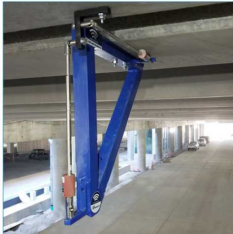
A two-axis jointmeter used to monitor vertical and horizontal movement.