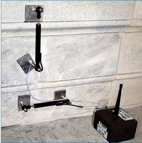
Two crackmeters connected to a GeoCloud wireless crackmeter node.