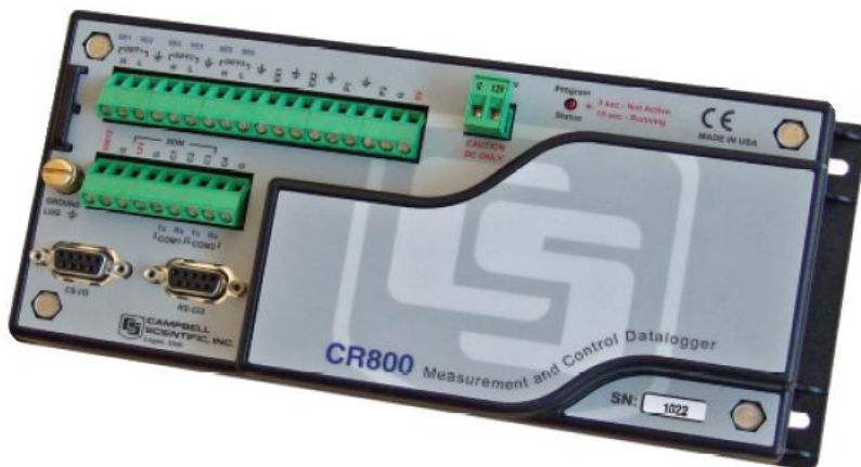
Above: Datalogger, measurement and storage module.

The 2/4 Channel VW Logger is a general purpose datalogger configured for vibrating wire sensors. Ideal for up to four VW sensors.